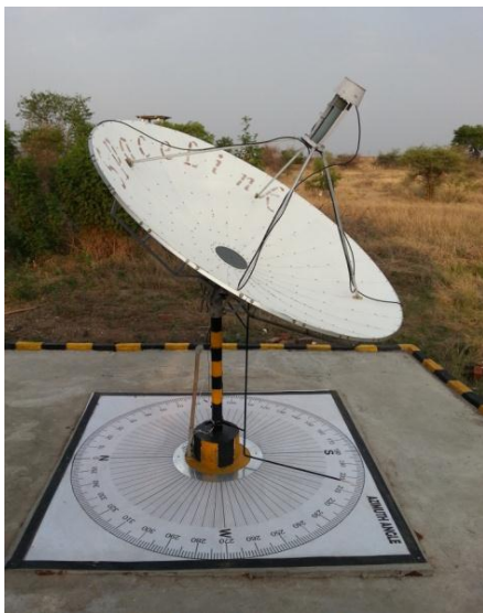
2.4M Dish with Prime Focus Feed named Small Wonder installed by WMO Jalna in 2013 and finds place in Limca Book of records in 2017