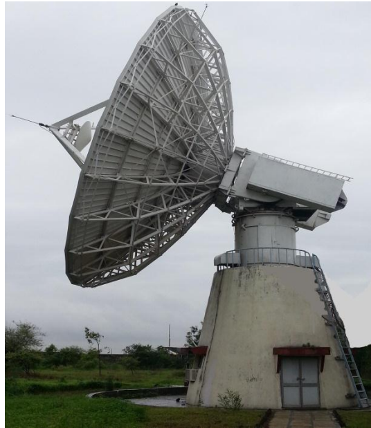
14M Dish installed by ISRO during 1992-93 with Cassegrain Feed