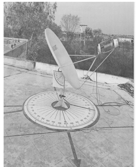
1.2M Dish with Offset Feed