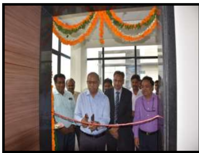
Launch of Southern Office by CMD TCIL