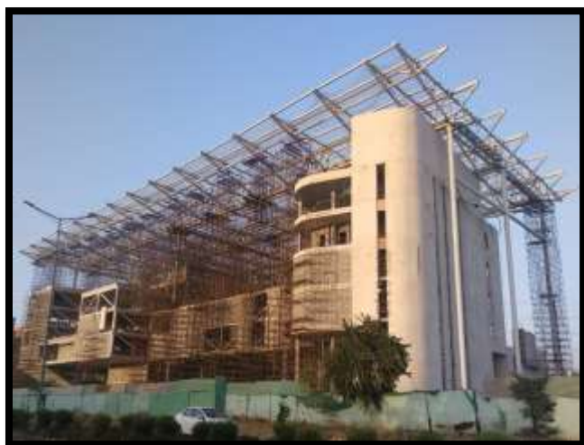
REC project work in progress of TCIL