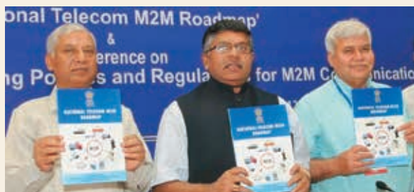
Hon'ble Minister inaugurating the National Telecom M2M Roadmap

prevailing communication technologies, standardisation activities and adapting them to suit Indian conditions in different sectors.