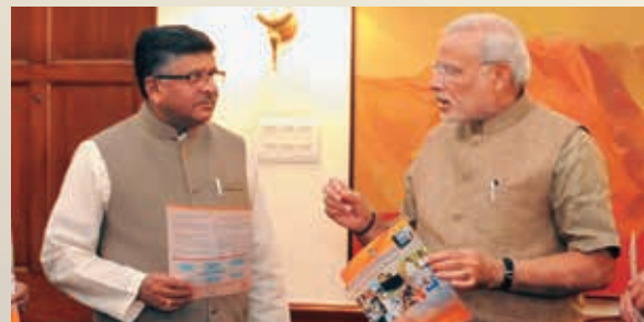
Hon'ble Prime Minister and Hon'ble Minister, Communications & IT, at the launch of 'Jeevan Pramaan' (Aadhaar based Life Certificate)