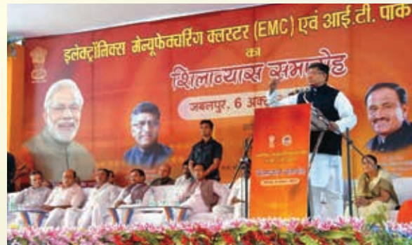
Laying the foundation stone of Electronics Manufacturing Cluster & IT Park at Jabalpur, Madhya Pradesh