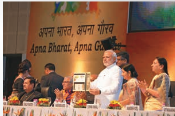
Release of commemorative postage stamps on 100 years of Mahatma Gandhi's return to India by the hon'ble PM.