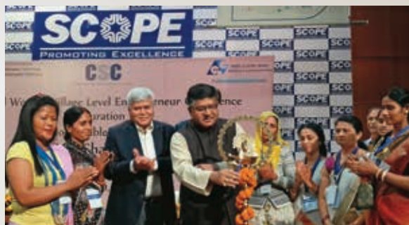
Hon'ble Minister, Communications & IT, lighting the lamp at the First Women VLEs Conference