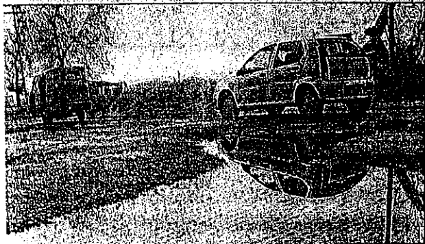
hat goes to Lonl was constructed just three years ago.